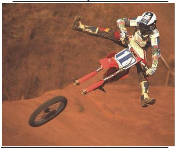
"This is gonna leave a mark!"